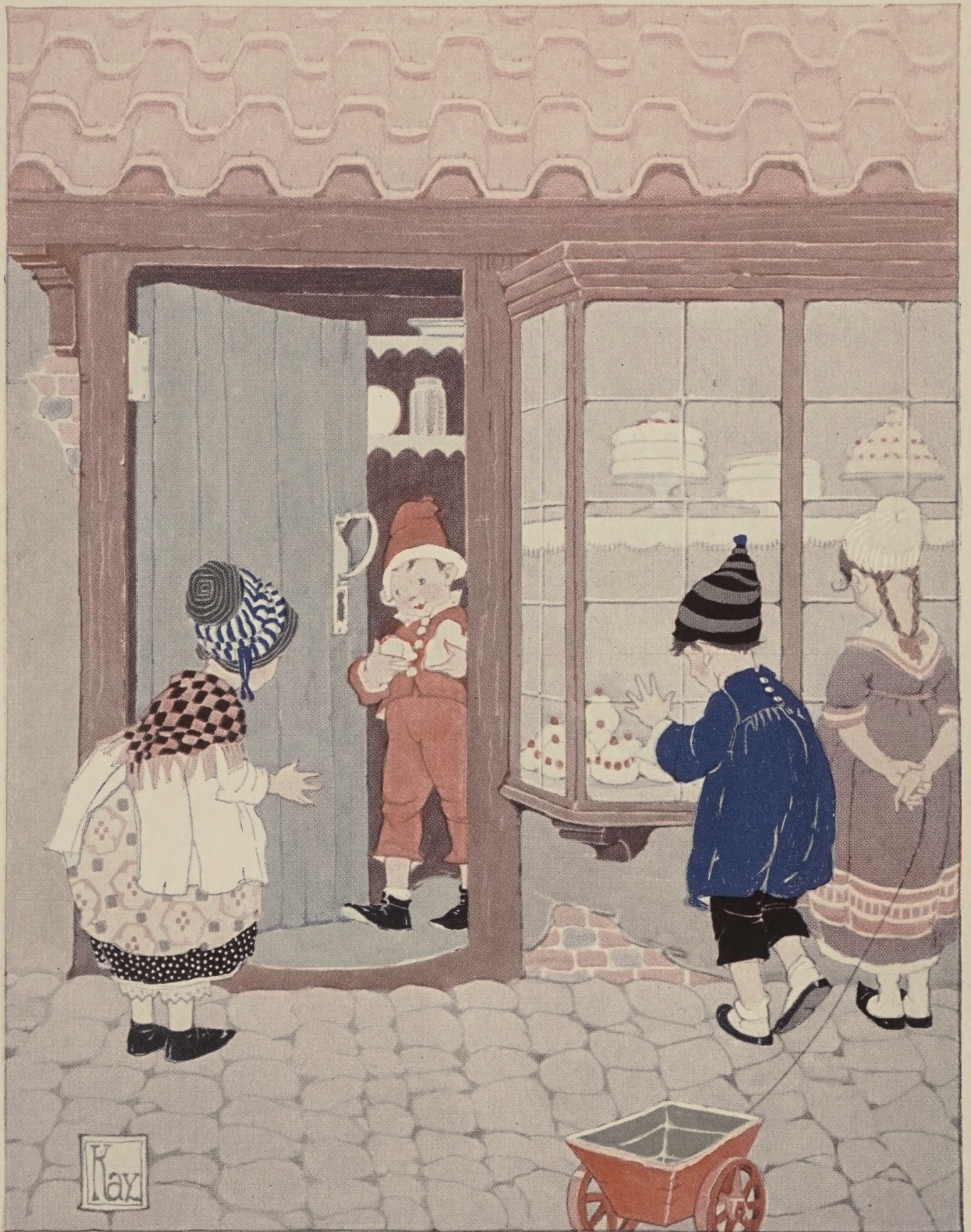
Santa would give them sweet things from the bake-shop until they could n't eat any more (See Page 3)